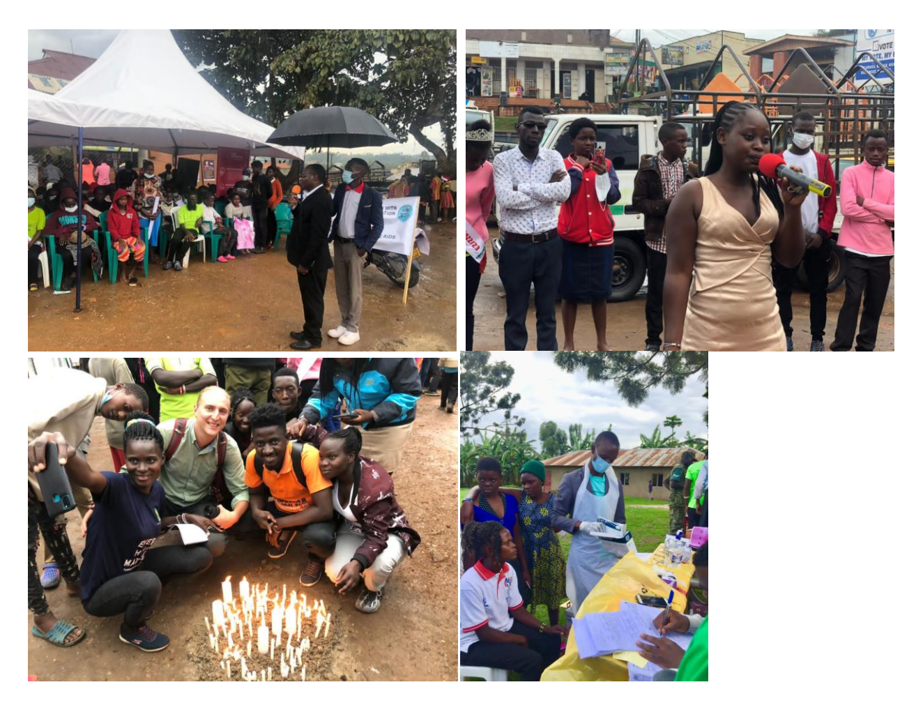
Different pictures from the candle light activity above

YAWE took the lead in participating in World AIDS day in the two areas namely Kabarole district, and Fort Portal City. The theme was "ending inequalities Among Adolescent Girls and Women". Kabarole is ranked 2<sup>nd</sup> in the whole country at 14.6 prevalence and this led to a call to increase our efforts to revert the trend of new HIV infections. Our participation was highly felt and appreciated by the guest of honour and other key guest around. The youths shared testimonies and committed themselves under their slogan HIV stops with me.