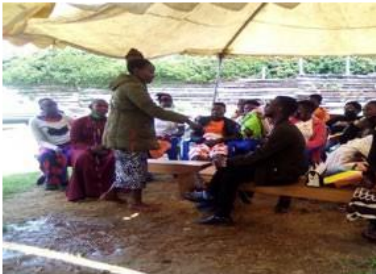
One of the Young Mothers, Sharing some of the Challenges