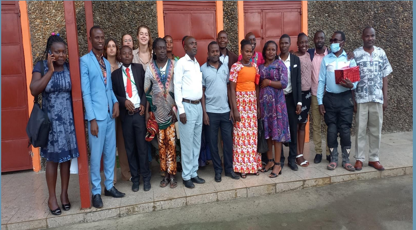
Figure 1 Photo of YAWE STAFF and Volunteers after our annual retreat December 2021