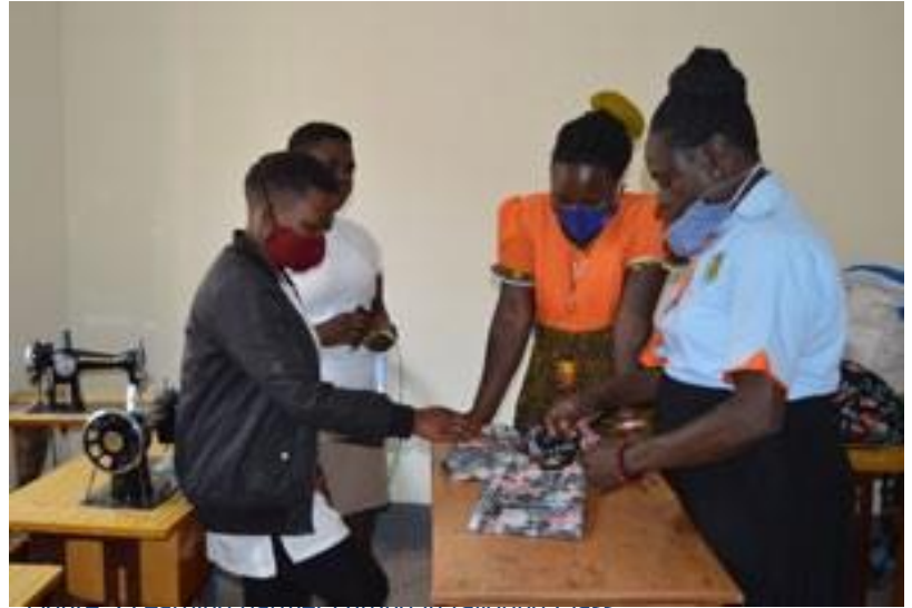
Figure 3 Learning garment cutting in tailoring class

certificate that is recognized by the government of Uganda known as modular assessment certificate under non-formal technical education through the directorate of industrial training (DIT)