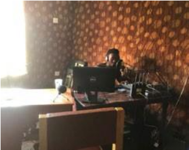
One of the volunteers at Yawe COMMUNITY RADIO STUDIO