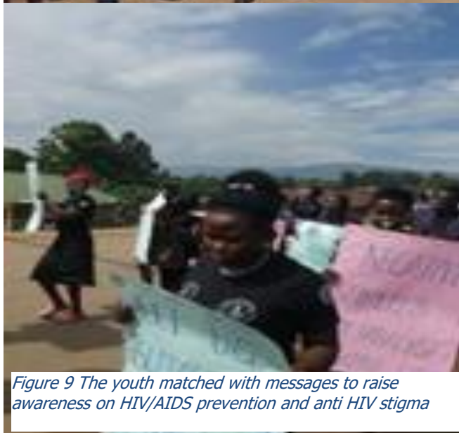
Figure 9 The youth marched with messages to raise awareness on HIV/AIDS prevention and anti HIV stigma

Due to Covid 19 challenges the day was not commemorated as it used to be in the past years. However, YAWE Foundation joined Fort Portal city authorities to commemorate World AIDS Day on 1st December 2021 in Fort Portal town with the following activities.