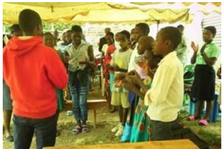
Energizer during the session

The second presenter gave career guidance to the learners, he started by introducing himself, relationship with Y A W E, education background and current work. This was aimed at inspiring learners to focus on why they go to school everyday, in coldness, walk long distances, go hungry etc. the learners were each asked what they wish to become and why....this was a turning point for many did not know why they go to school even those in secondary!! One secondary learner said she goes to school because it is a must to go to school. This raised a concern for more career guidance sessions in our workplans for our learners as an organization.