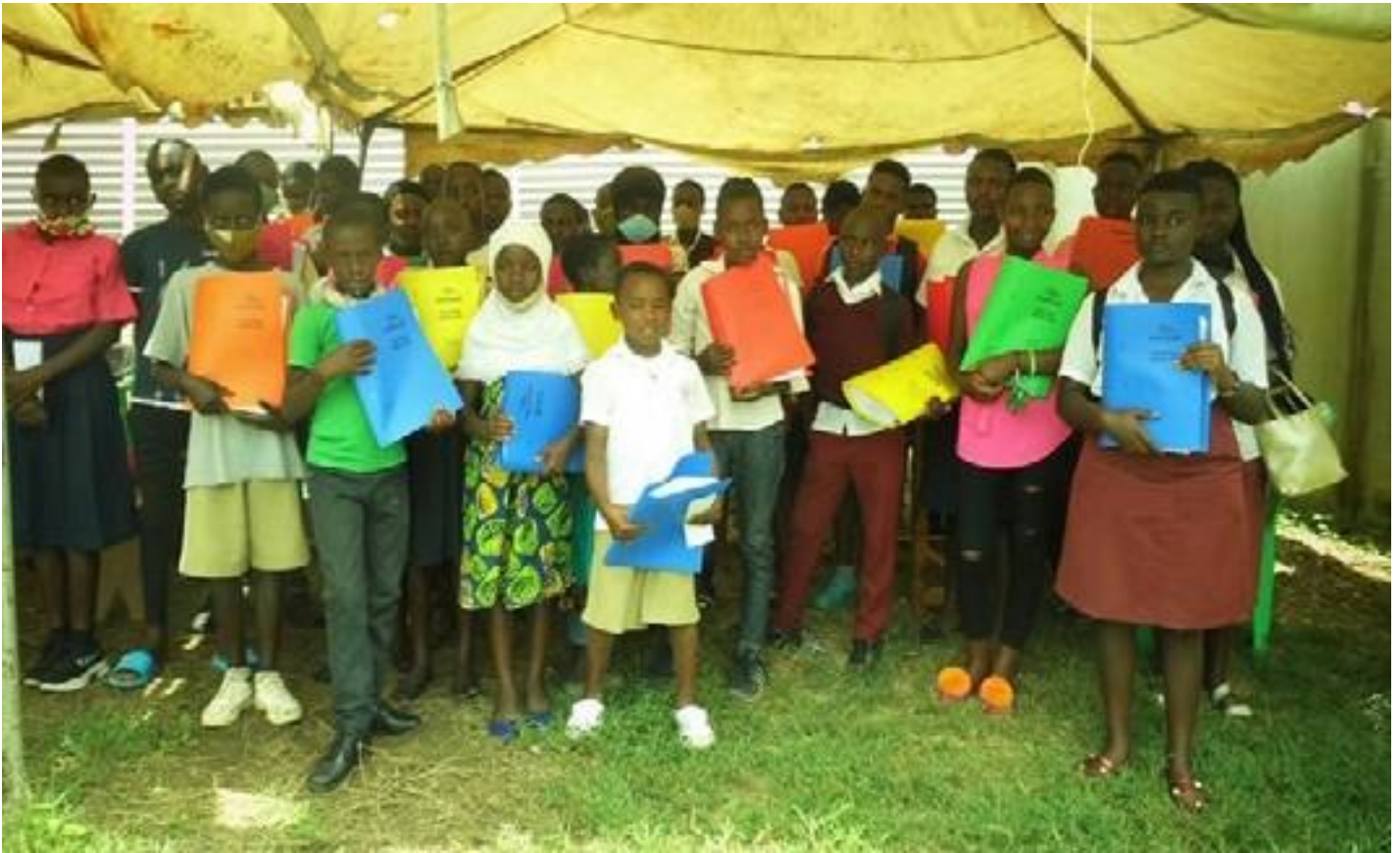
Figure 4 Pupils and students receive reading materials to continue learning from home during lockdown

Y A W E gives fuel to them in terms of school fees and the caregivers give shelter, food, medical care etc as motor vehicle oil, tyres and the rest, and the learners role is basically to drive. The bad driving meant indiscipline, absenteeism, pregnancy, bad peer pressure, dodging lessons etc. Again during the discussion it was found out that all the learners had no idea of home study being on the website for them to access.