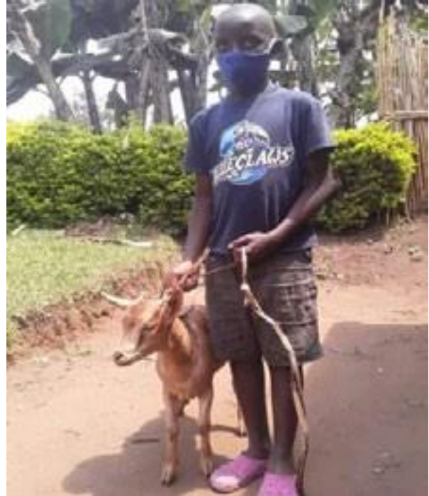
Figure 14 Beneficiaries of goats for life Program