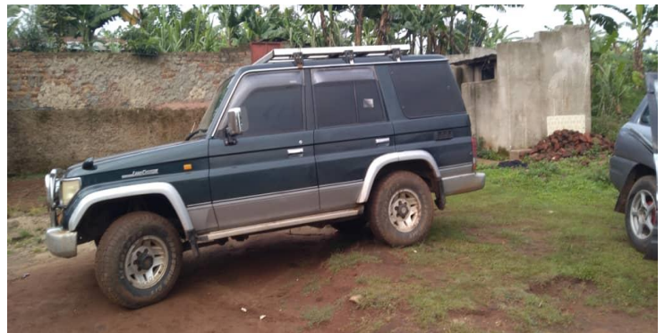
Figure 2 Our newly acquired second hand Field vehicle is in good condition ready to traverse villages during home visits and outreaches our roads requires a four-wheel drive

Our community activities were made easier this year though interrupted by Covid 19 with an acquisition of a field vehicle Prado which transports staff to different areas bringing services nearer to the people in hard to reach areas. and properties around.