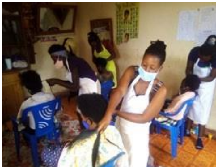
Figure 7 Practical Hair dressing training session

During the year 2021 we had a challenge of lockdown and we could only