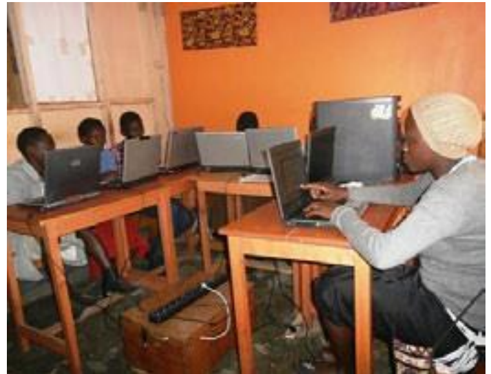
Figure 6 Computer Literacy Sessions