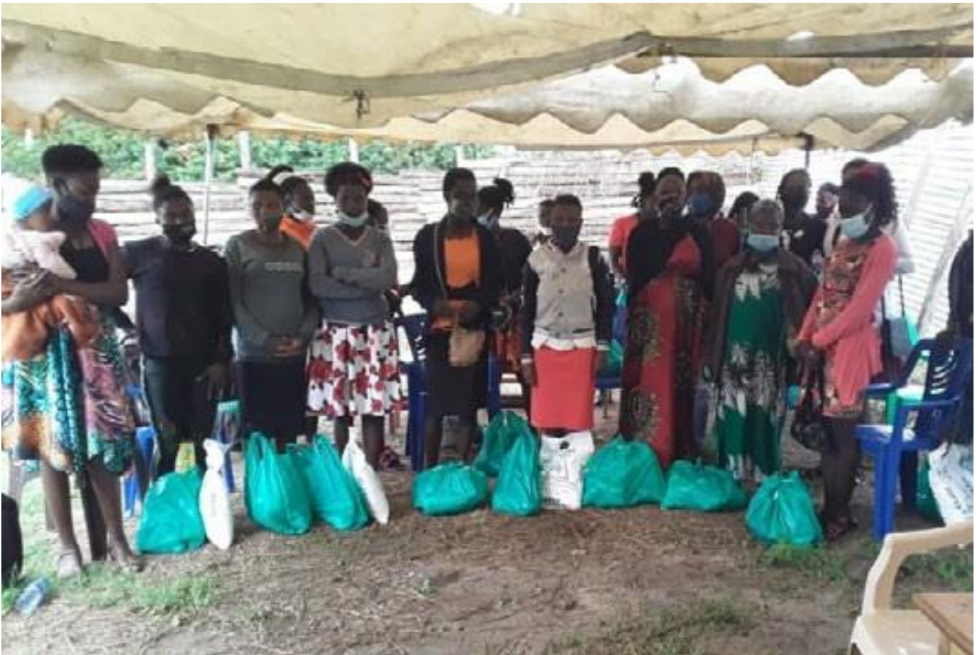
Figure 11 Group Photo of Young Single mothers after receiving food relief