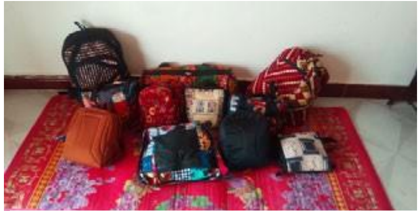
Figure 3 Sample bags made by YAWE Women

YAWE women make and sell handcrafts including, African bags, baskets, African attire, paper beads, tablemats, jewellery . these handcrafts are sold here and in Austria to generate an income for the women most of whom are widows with orphans to provide for. Although this year's sales were much affected by the lockdown due covid 19 worldwide.