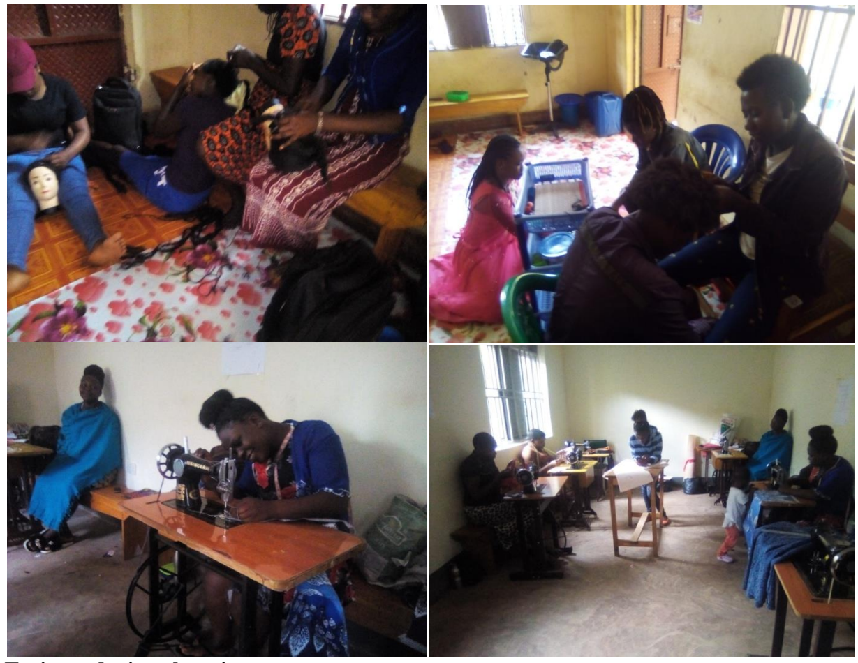
Trainees during class time